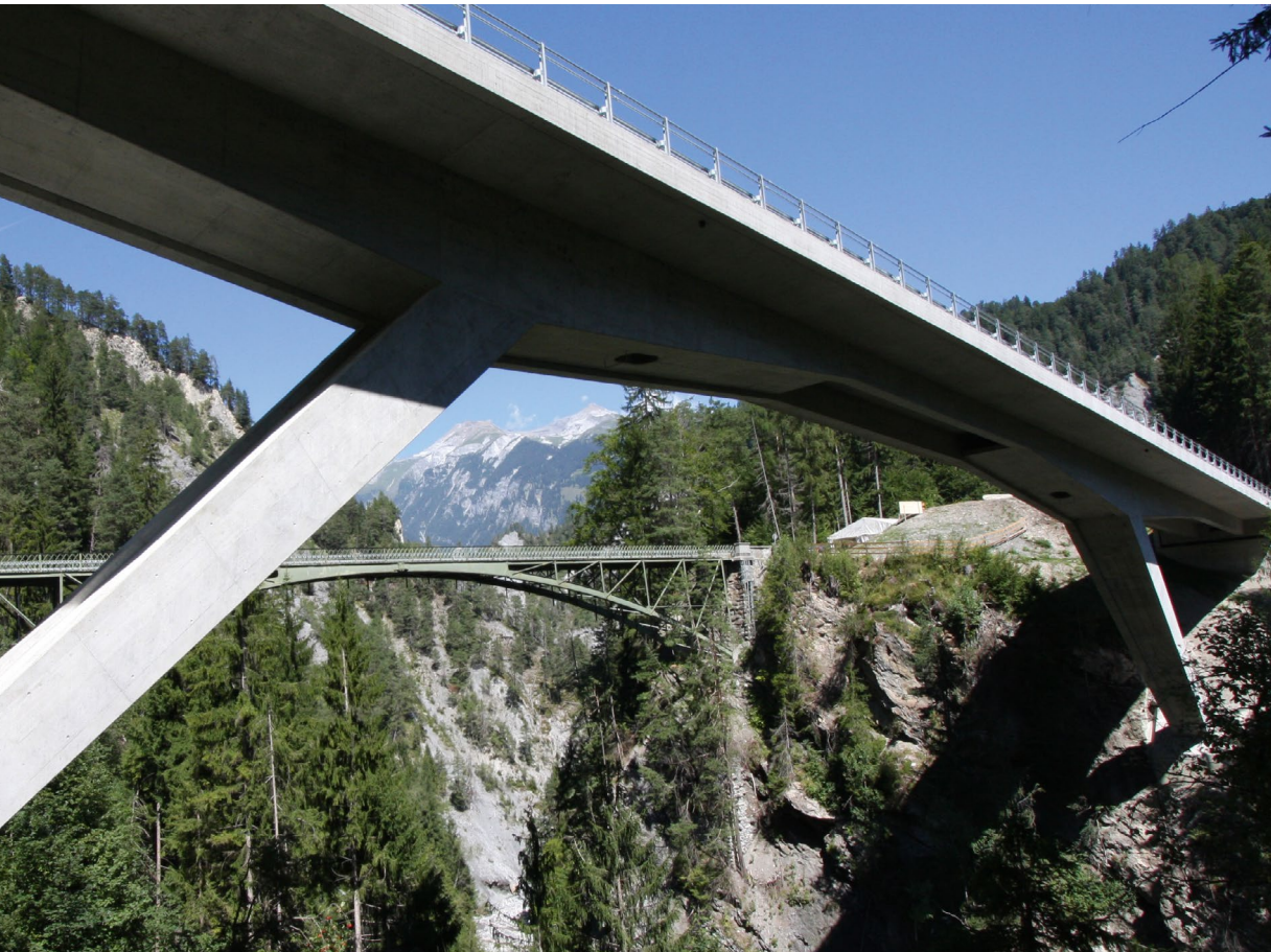
Versamertobel Bridge, Graubünden Canton, Switzerland